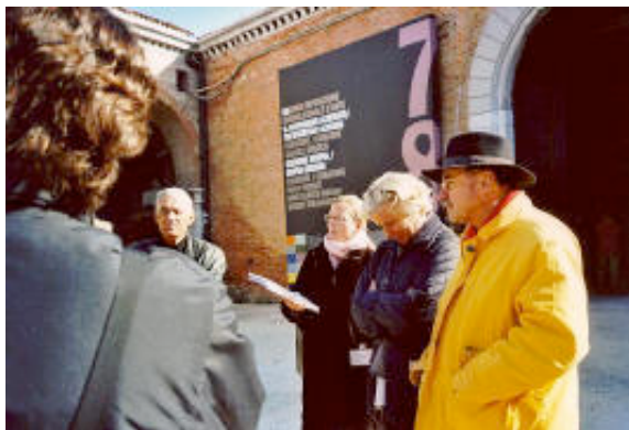
A&K an der 50. Biennale 2003